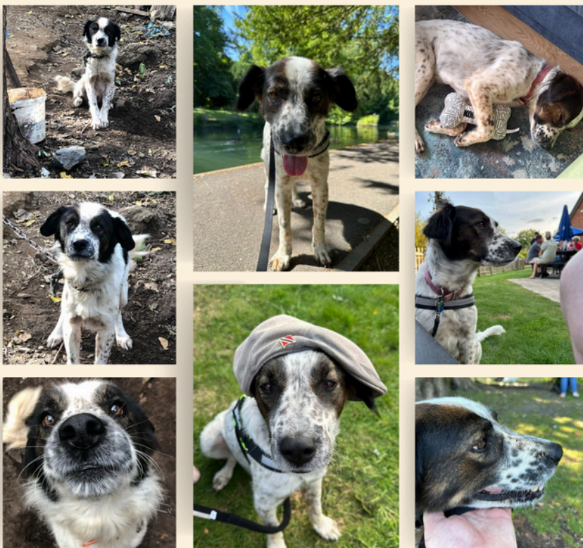
From a Life on a chain to a happy Life in the UK