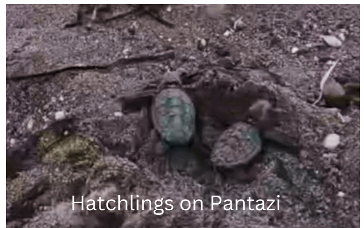
Hatchlings on Pantazi

The best protection you can invest in to protect your animals if you live in Greece, is to ask your local vet for a "poison" kit. You will be given a set of injection needles, ampules and instructions on how to inject the medication when you suspect your dog has eaten poison. It will make your dog vomit immediately and this will prevent the poison from getting further into the bloodstream. Take your pet to the vet immediately after that so that they can further stabilise them.